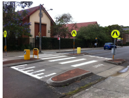
Photo 5 Existing pedestrian crossing at Kensington Road

The topography of the path of travel to public transport services located on Anzac Parade has been surveyed, and a long-section is provided at Annexure 2. The calculated grades comply with the requirements of the Clause 26 (3) (i)-(iii) with the minor exception of the gutter crossings on either side of the existing pedestrian crossing within Kensington Road. Insertion of a gutter grates at these kerb lines would remove this minor exception (see Photo 5 below).