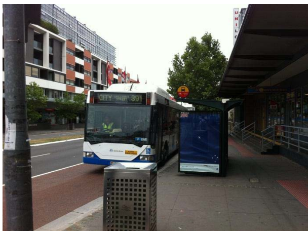
Photo 4 Bus stop 203346 Anzac Parade(west side)

Bus Stop No. 203346 (Anzac Parade near Addison Street) and Bus Stop No 203324 (Anzac Parade near Darling Street) are serviced by a number of routes that connect directly with the Sydney CBD, East Gardens, Bondi Junction and Coogee. All these destinations provide the facilities specified within Clause 26(1) within 400m of the respective transport service. Numerous routes serve these bus stops (inward and outward) on either side of Anzac Parade, multiple times, daily. Copies of relevant timetables are provided in Annexure 3.