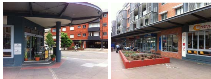
Photos 1 - 3 Services, facilities & retail Anzac Parade Commercial Strip

The Anzac Parade commercial strip is located less than 400 metres to the east of the Kensington site, and is accessible via a travel path that has an overall gradient of less than 1:14 (see Annexures 1 and 2). Services available within the Anzac Parade commercial strip include retail, convenience shops, cafes, bank service providers, medical practitioners and community and recreational facilities (Photos 1 – 3).